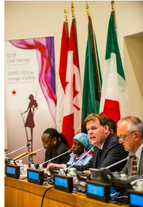
Former Canadian Foreign Affairs Minister John Baird delivers remarks at the Ending CEFM event on the margins of the 69th United Nations General Assembly.