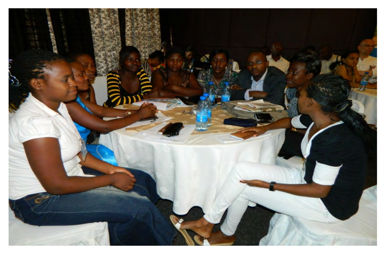
Girls from CDF/FORWARD Project in Musoma & Tarime