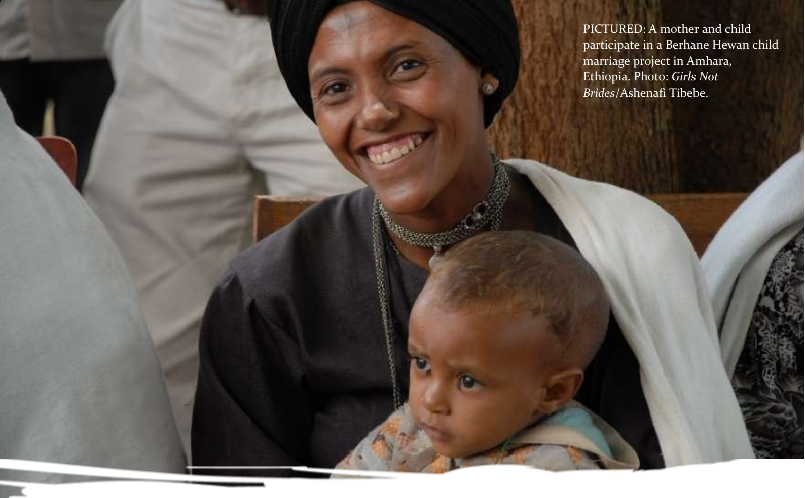
PICTURED: A mother and child participate in a Berhane Hewan child marriage project in Amhara, Ethiopia.