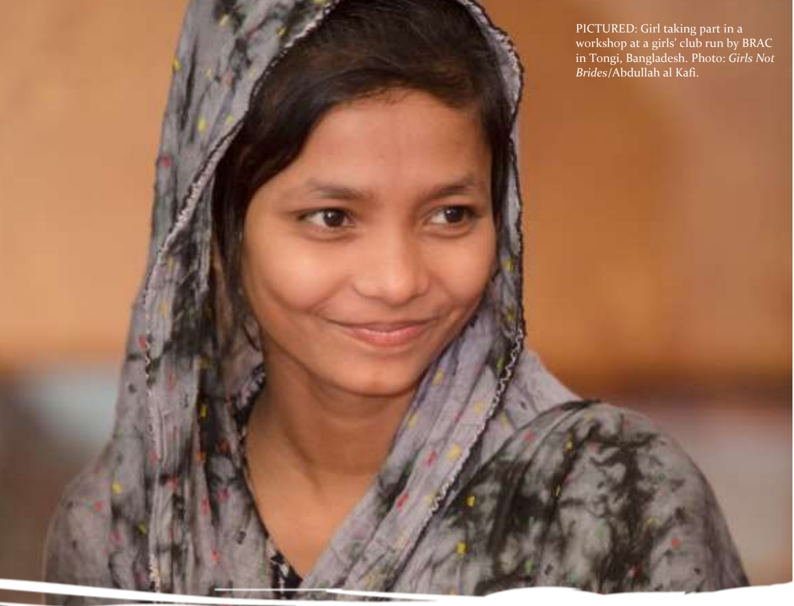
PICTURED: Girl taking part in a workshop at a girls' club run by BRAC in Tongi, Bangladesh.