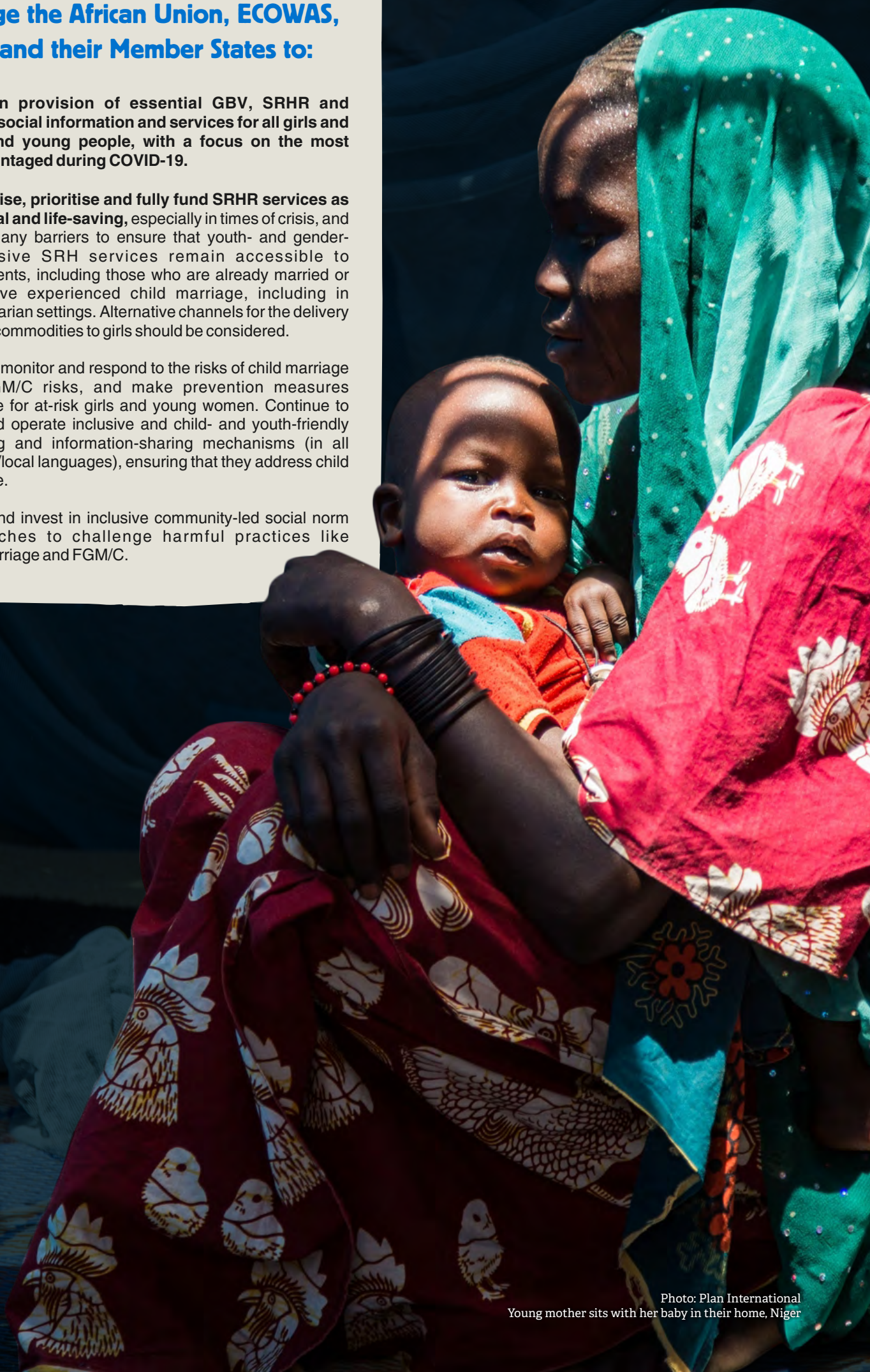
Young mother sits with her baby in their home, Niger