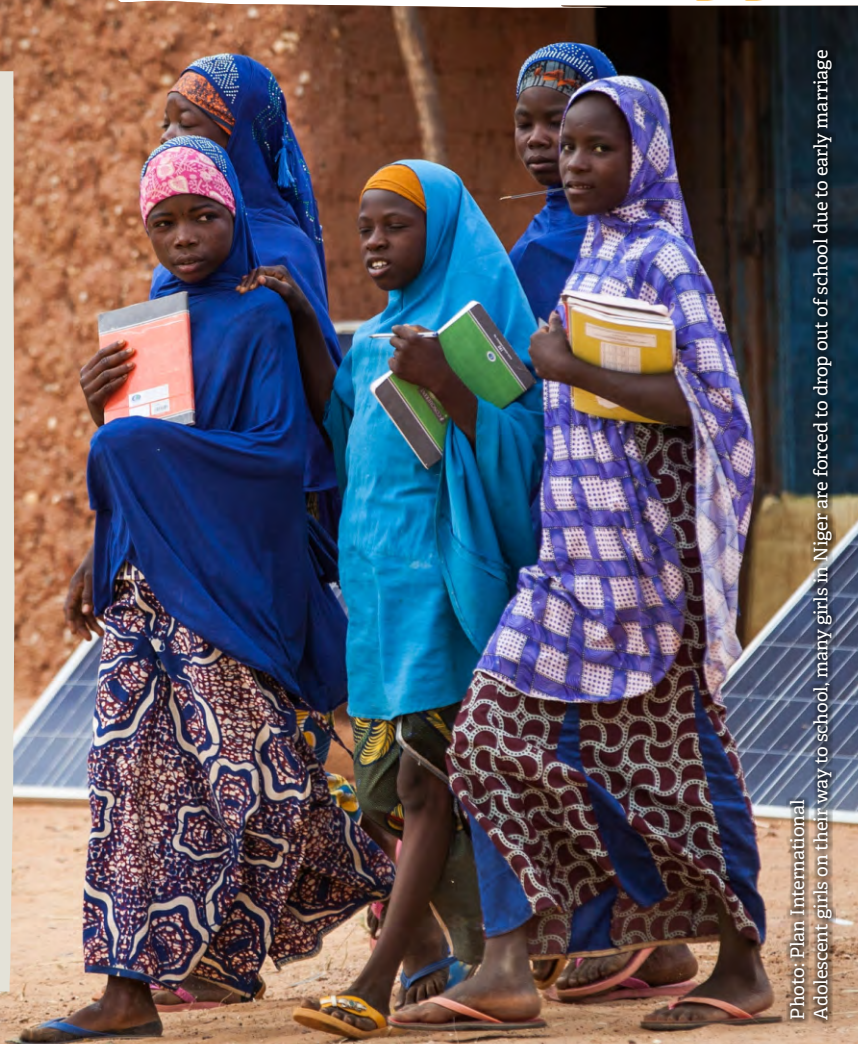
Adolescent girls on their way to school, many girls in Niger are forced to drop out of school due to early marriage