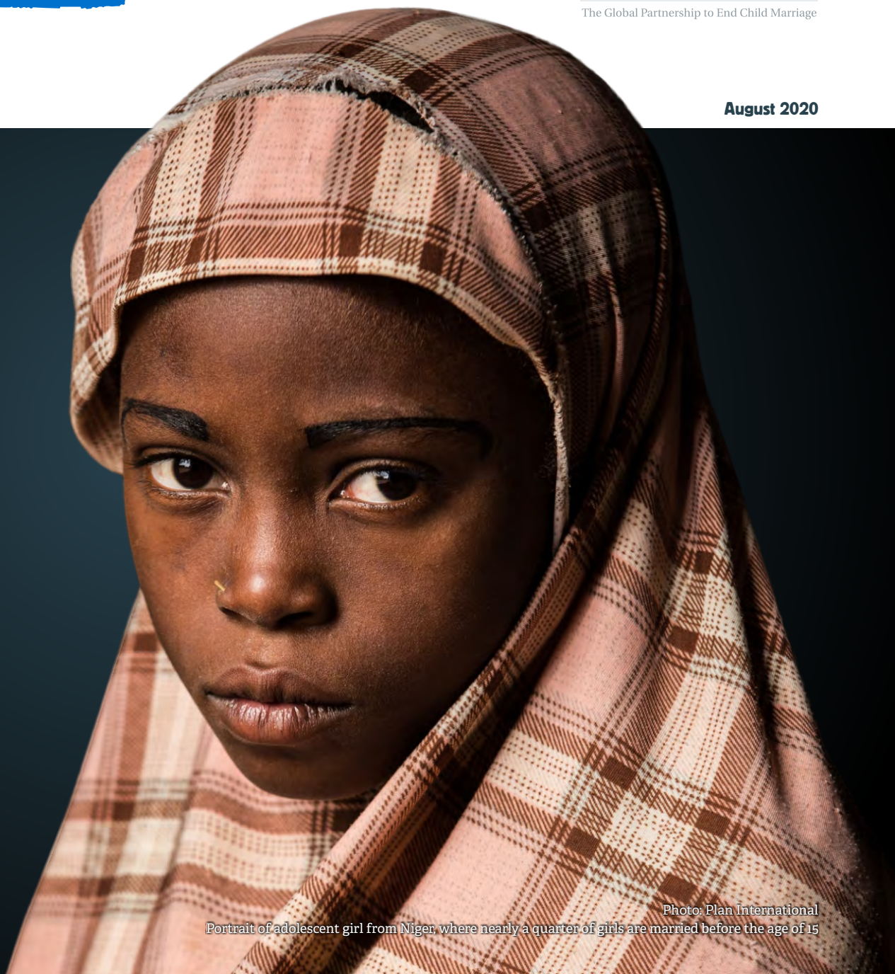
Portrait of adolescent girl from Niger where nearly a quarter of girls are married before the age of 15